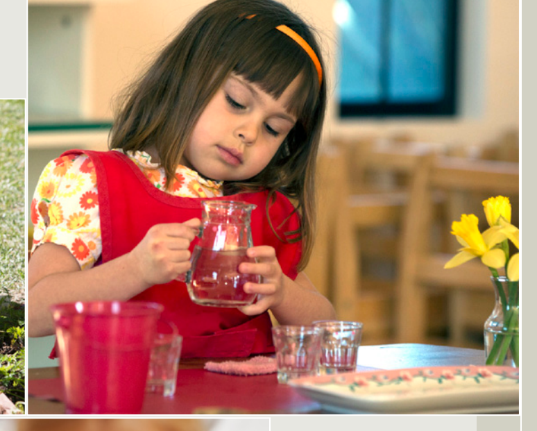
Children at Lifetime Montessori progress at their own pace and gradually discover their potential by working with self-correcting Montessori materials.