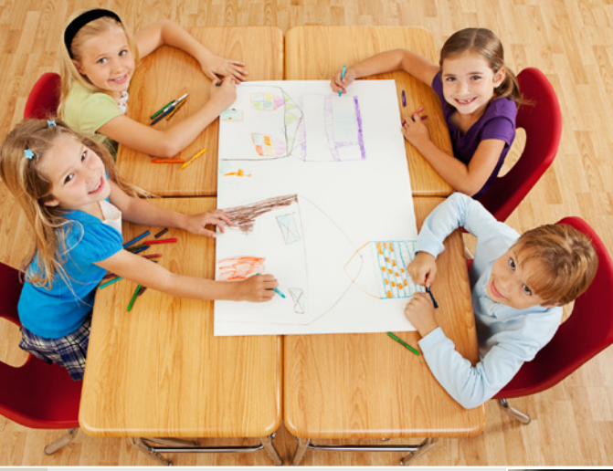
Lifetime Montessori's teachers are highly educated, and they've all completed the rigorous Association Montessori International training.